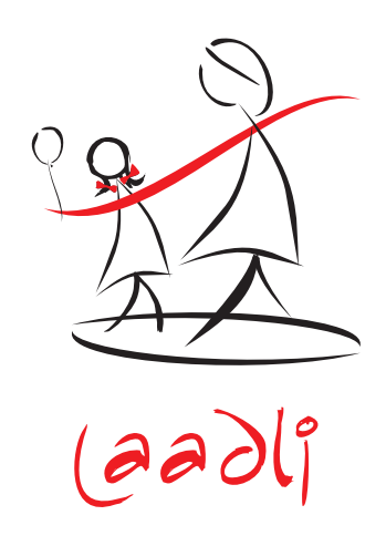
Celebrate Her Life An Initiative by Population First