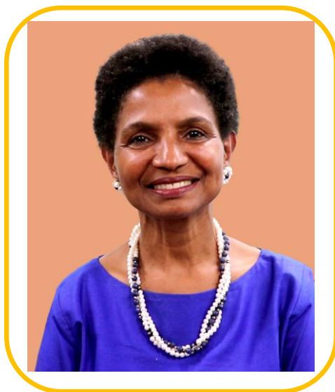
MS. ARGENTINA MATAVEL PICCIN, REPRESENTATIVE, INDIA & COUNTRY DIRECTOR, BHUTAN, UNFPA

In recognition of the critical role that the media plays in shaping popular perception about gender roles and identities and addressing discriminatory practices, UNFPA has been partnering with Population First for over a decade to work with the media through a campaign called Laadli (The cherished girl child). The campaign looks at integrating gender and challenging gender stereotypes in news reporting, commercial advertising and films.