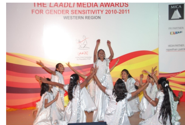
Dance performance at the Western Region Awards in Ahmedabad