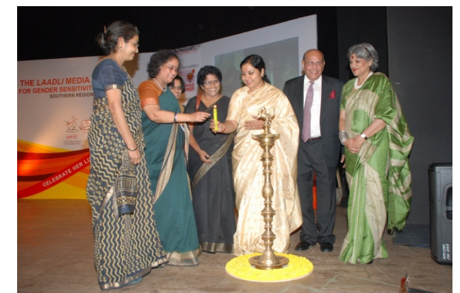
Lighting of the Lamp at the Southern Region Awards