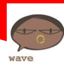
WOMEN ALOUD VIDEOBLOGGING FOR EMPOWERMENT waveindia.org, Goa

WEB MEDIA-English BEST WEB FEATURES The Many Perceptions of rape et al