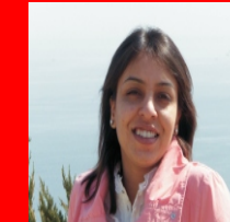
TENA THACKER Indian Express, Delhi

PRINT MEDIA-English BEST NEWS REPORT Single Women Left Out Of NREGS