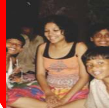
SHUBHANGI SWARUP , Open Magazine