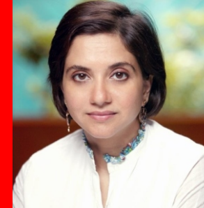
TANUJA CHANDRA Bollywood-Director