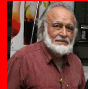
RAHUL SINGH Writer, Columnist