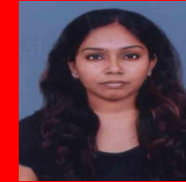
SANGEETHA NEERAJA The New Indian Express, Chennai

PRINT MEDIA-English BEST FEATURE City's Suicide Point