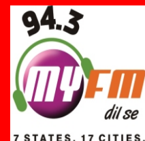
94.3 MY FM NOIDA

ELECTRONIC MEDIA-Hindi BEST HUMAN INTEREST STORY Hauslon Ki Udaan-Sarvesh Photographer