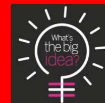
TANYA CHAITANYA Femina

PRINT MEDIA-Hindi BEST FEATURE Ladies Special