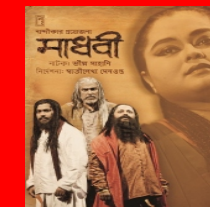
NANDIKAR THEATRE GROUP, Kolkata

SPECIAL AWARD CONSISTENT WRITING ON WOMEN ISSUES