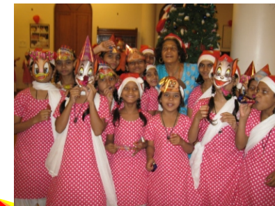
D. M. JARIWALA ORPHANAGE

Bridging the East and the West, Usha Uthup, has transcended the barriers of caste, creed, language and nationality with her endearing charm and powerful vocal chords. Usha is India's first and only international artiste with six english language song releases. She has broadcasted over All India Radio and appeared on Doordarshan a number of times. For Usha, music is not just her life-style, but it is an instrument of love. The original Diva of Indian pop music celebrates three decades in the entertainment business, and while her contemporaries might be thinking of gentle retirement, Usha will be back in the thick of what she does best - singing.