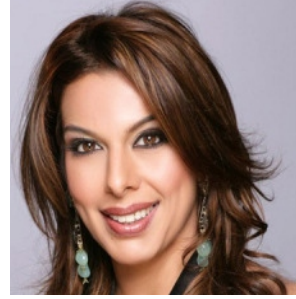
POOJA BEDI Actress