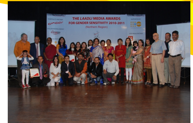
Northern Region Award winners with the organisers