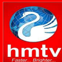
N. VISHWANATH HMTV, Hyderabad

ELECTRONIC MEDIA-Telugu BEST FEATURE Samabhavam