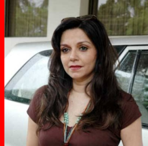
LILETTE DUBEY Actress