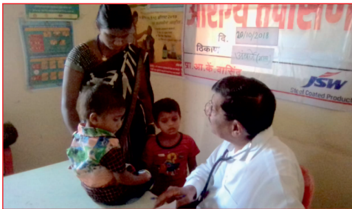
Health checkup of children at Ambarje village

Ambarje is a remote village of Shahapur block spread over 745 hectares of land with a population of 1876 people. It has limited access to medical facilities located as it is 13 km away from Shahapur and 74 kms from District Head Quarter Thane.